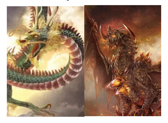
Figure 2. Dragon